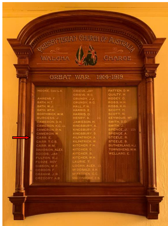
Presbyterian Church of Australia – Walcha Charge - Great War Honour Roll