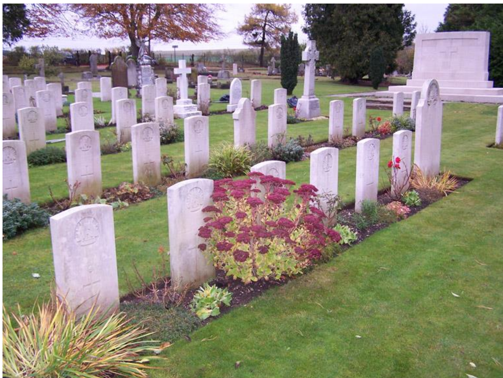
Durrington Cemetery, Wiltshire