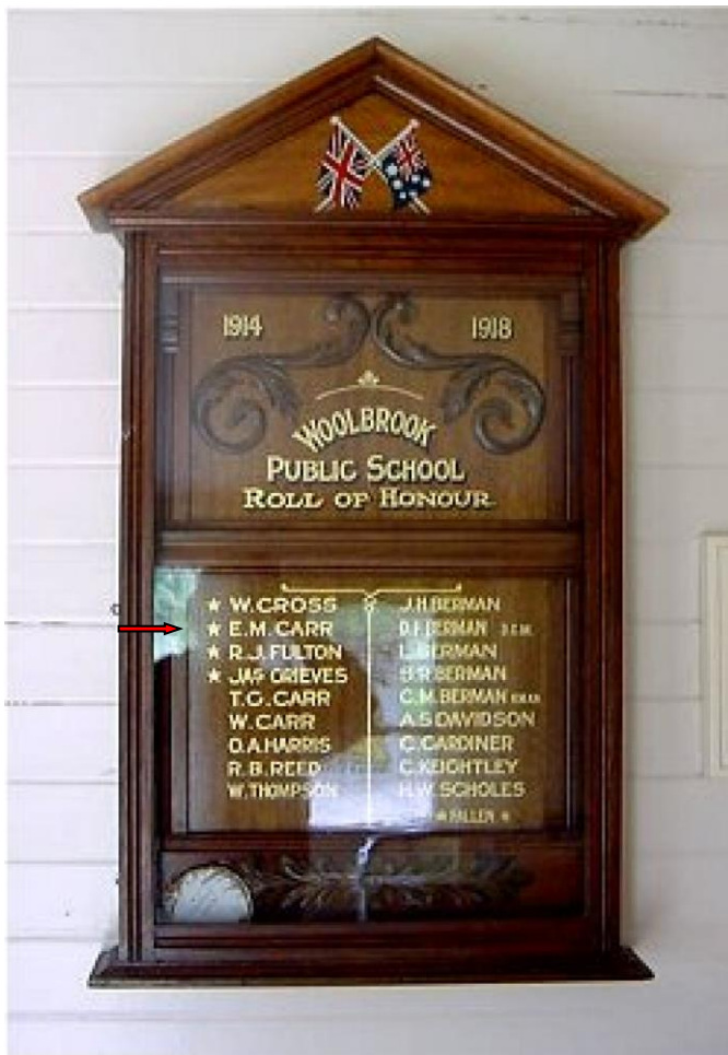
Woolbrook Public School Roll of Honour