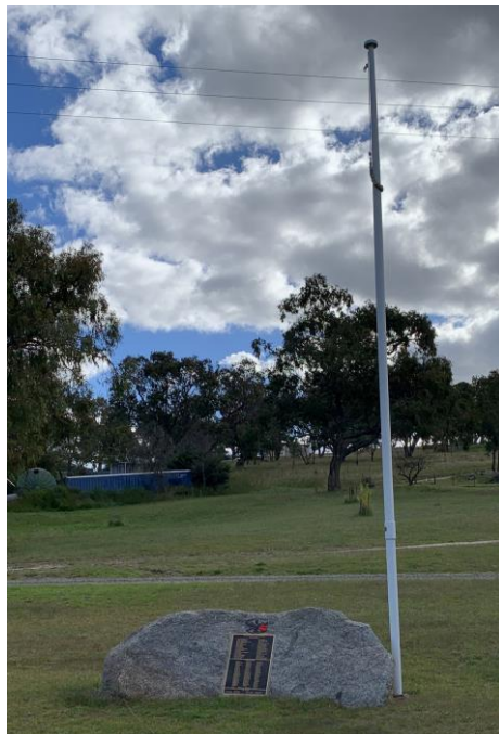
Woolbrook War Memorial