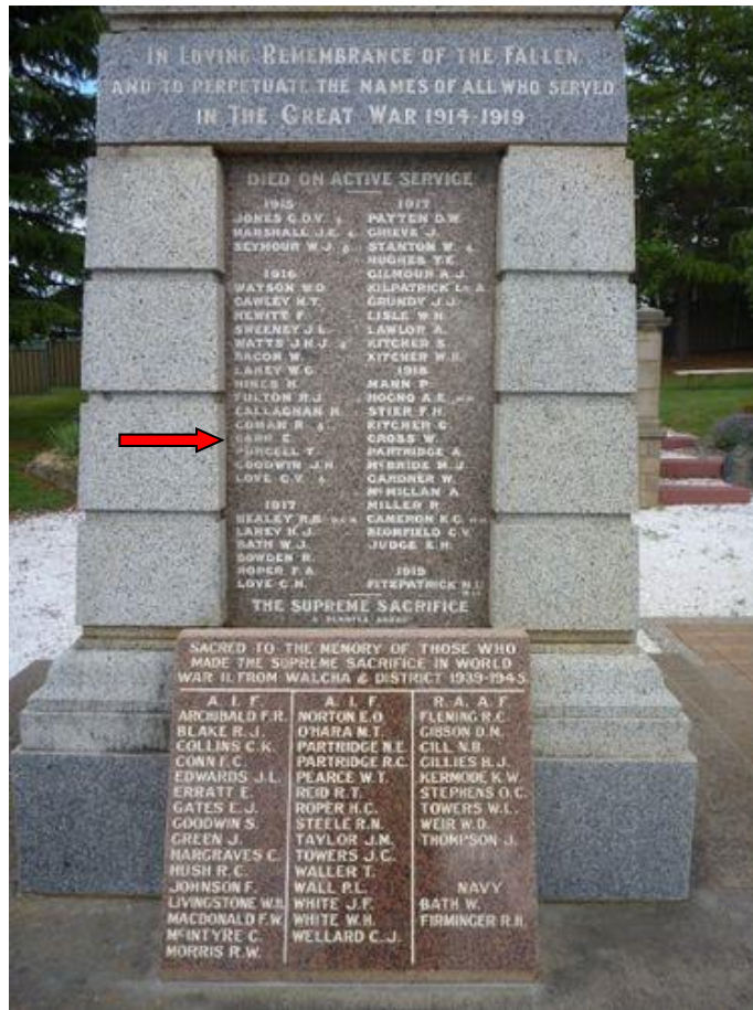
Walcha & District War Memorial